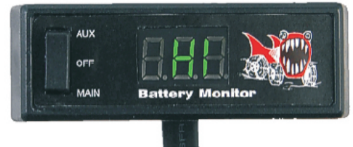
HIGH VOLTAGE DISPLAY