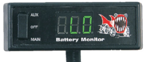
LOW VOLTAGE DISPLAY